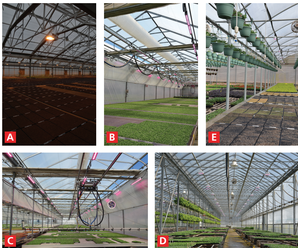
Figure 1. Supplemental lighting of young plants utilizing A) high-pressure sodium lamps, B-D) various commercially available high-intensity light emitting diode (LED) fixtures or E) LED photoperiodic lighting.