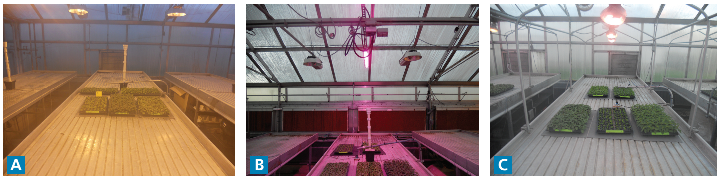
Figure 2. A) Examples of high-pressure sodium (HPS), B) light-emitting diode (LED) Top lighting and C) photoperiod treatments (wire mesh was used to reduce light intensity).